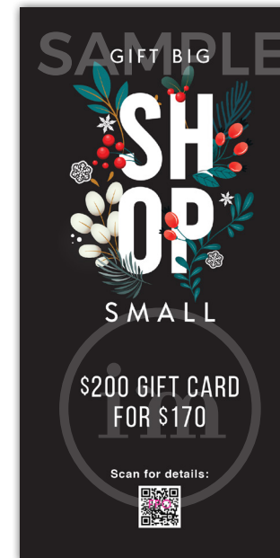
Option B: Shop Small Holly