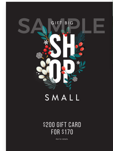
Jumbo Poster with campaign art