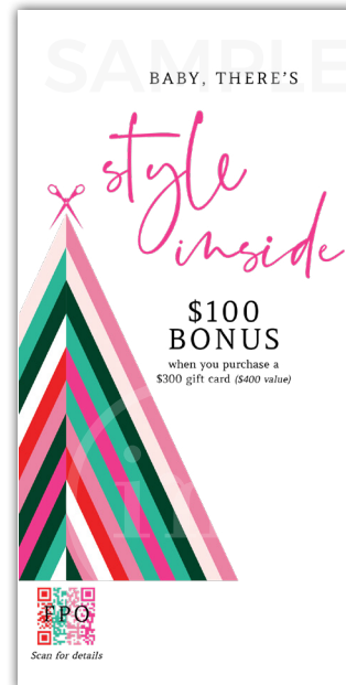
Option A: Modern Tree