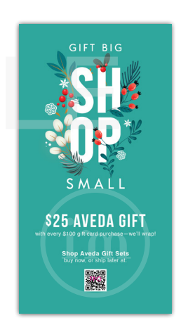
Option B: Gift Tag