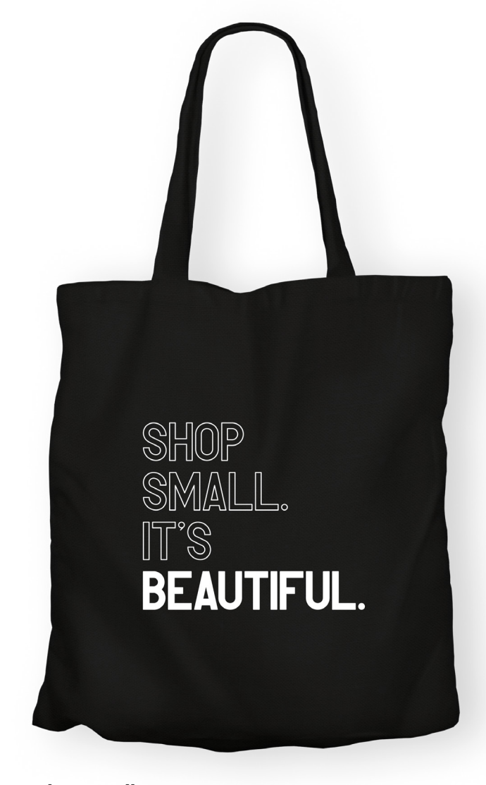
Shop Small Tote Bags Great for gift with purchase (see next page for pricing)