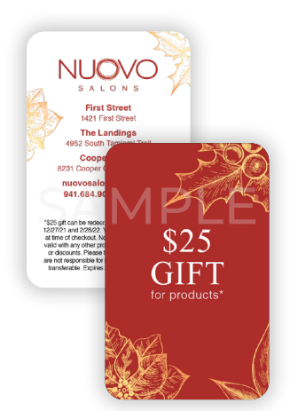
Product Bounceback Vouchers