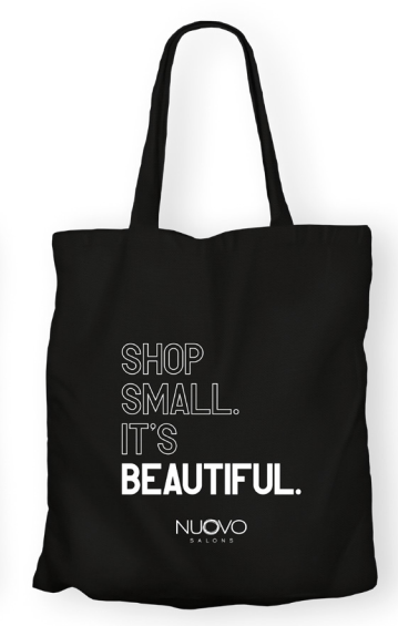
with salon logo