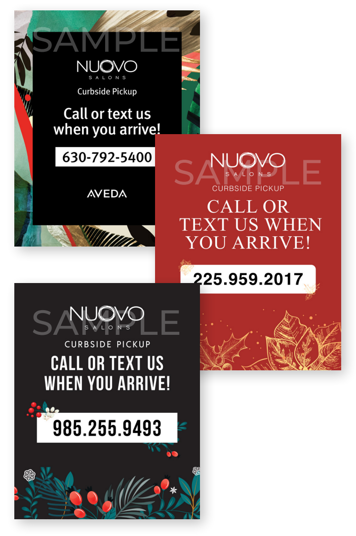
Curbside Poster with campaign art