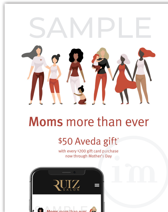
Option A: Coral