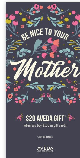
Option B: Pink Mirror Cling